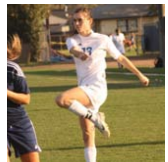
Lady Lancer Soccer