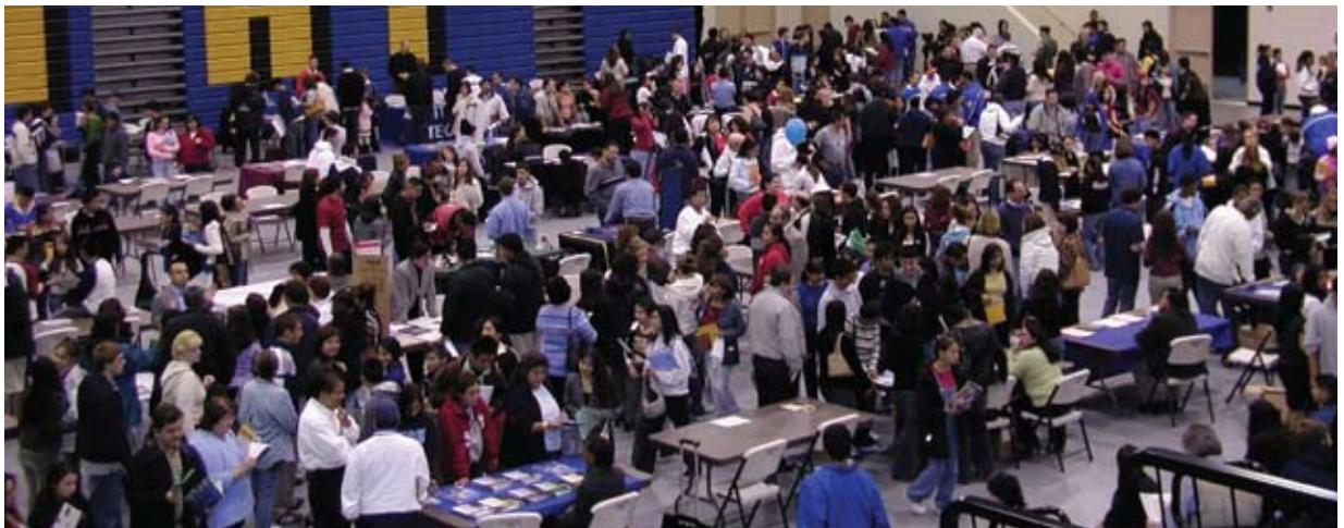
Students and parents attend annual College Night