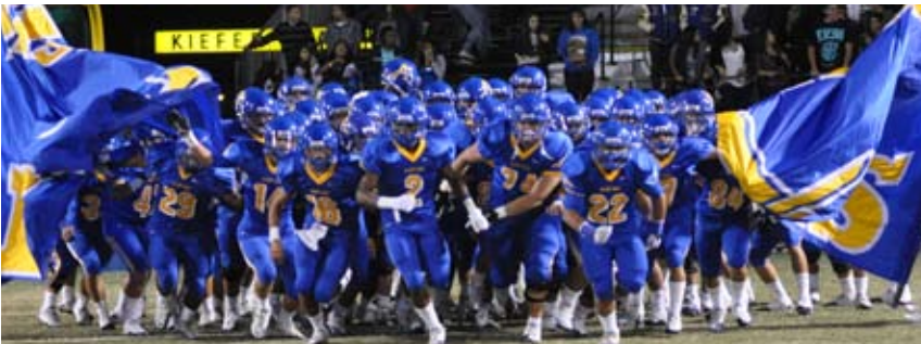
Friday Night Football at Kiefer Stadium