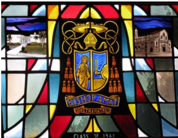
Stained glass panel in the School Chapel

In summary the Bishop Amat Religion Program is designed to form our students into a Christian community by helping them to learn about Jesus in their formal religious studies and bringing them to love and serve Him through worship, prayer and service to His people.