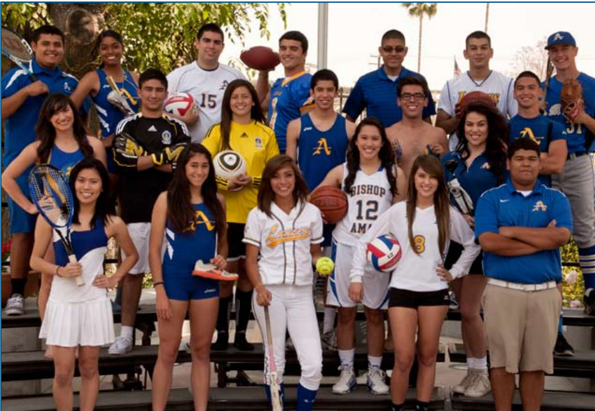
2010-2011 All Sport Picture (representing 20 sports)