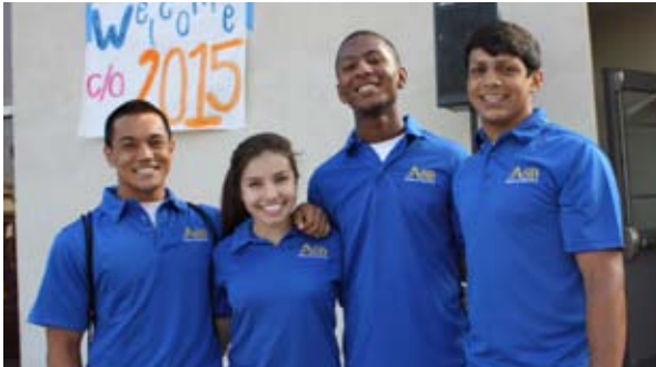
2011 - 2012 ASB Officers welcome Class of 2015

The Bishop Amat High School philosophy is based on the belief that a student's character is formed not only in the classroom but also through extracurricular activities. Involvement in student government, sports, clubs and organizations is essential to the development of a well-rounded individual.