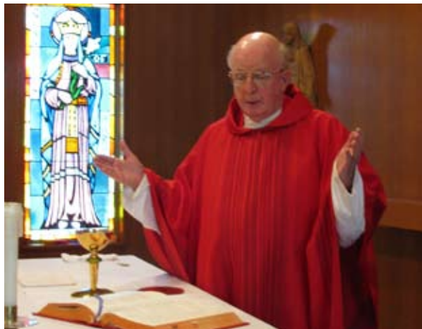
Monsignor Carroll celebrates morning Mass