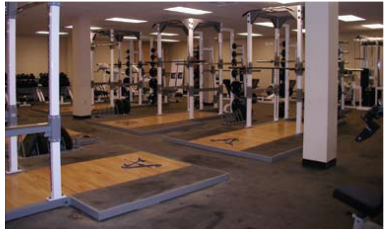
Bishop Amat Fitness Center