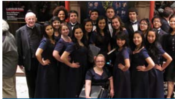
Lancer Choir performs at New York City Carnegie Hall

The school has a very successful Fine Arts and Performing Arts program. Students are afforded opportunities to participate in Band, Drum Line, Chorus, Drama, Speech and Junior Statesman of America programs. The school also fields a Color Guard Unit and Baton Twirlers, Competitive Dance and Pep Squad Teams.