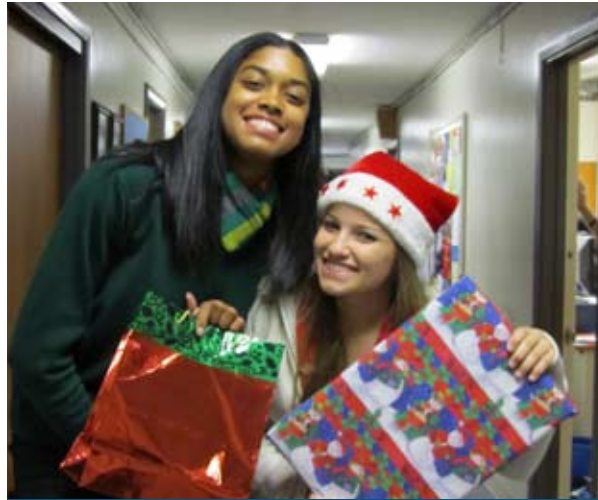
Seniors prepare for Christmas party at Dolores Mission

Mindful of what Jesus taught us about the importance of serving the needs of our brothers and sisters the school provides our students with a wide array of Christian Service opportunities. They participate in the Adopt-a-Grandparent Program, they assist severely disabled patients at the Lanterman Development Center and disadvantaged youth at the Delhaven Community Center.