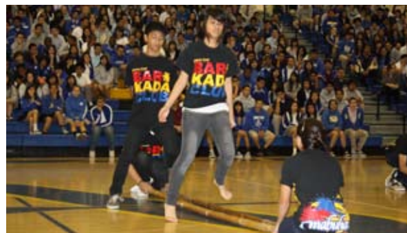
Barkada Club performs at the Cultural Assembly

Bishop Amat is excited to announce that beginning with the 2011-2012 school year, we are fielding a Robotics Team that will compete in the VEX Robotics Competitions.