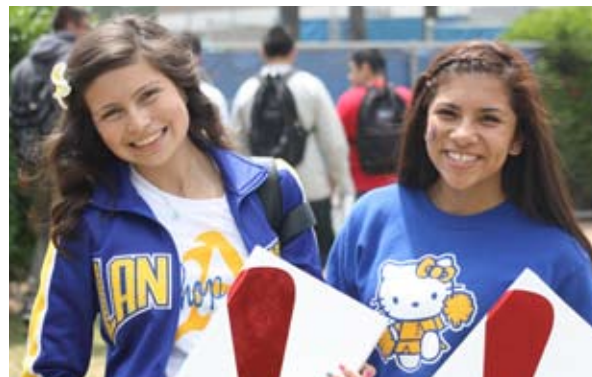
Yearbook Picnic 2011

Students who wish to develop journalistic talents may join the staff of the school newspaper, The Lance or the award winning yearbook, Tusitala .